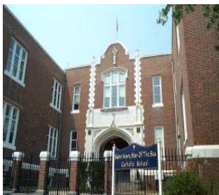
"Ave Maris Stella"

NON-PROFIT ORGANIZATION U.S. POSTAGE PAID Far Rockaway, N.Y. Permit No. 56