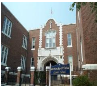
"Ave Maris Stella"