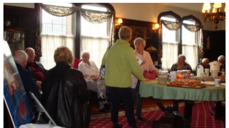
St. Mary Star of the Sea Alumni Mass Saturday, November 21, 2009