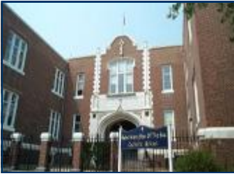
"Ave Maris Stella"

Rectory: 1920 New Haven Avenue Far Rockaway, NY 11691