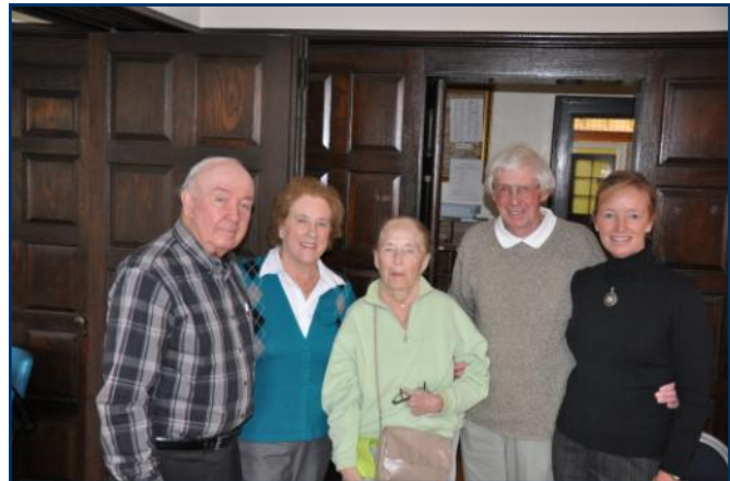
St. Mary Star of the Sea Alumni Mass Saturday, November 20, 2010